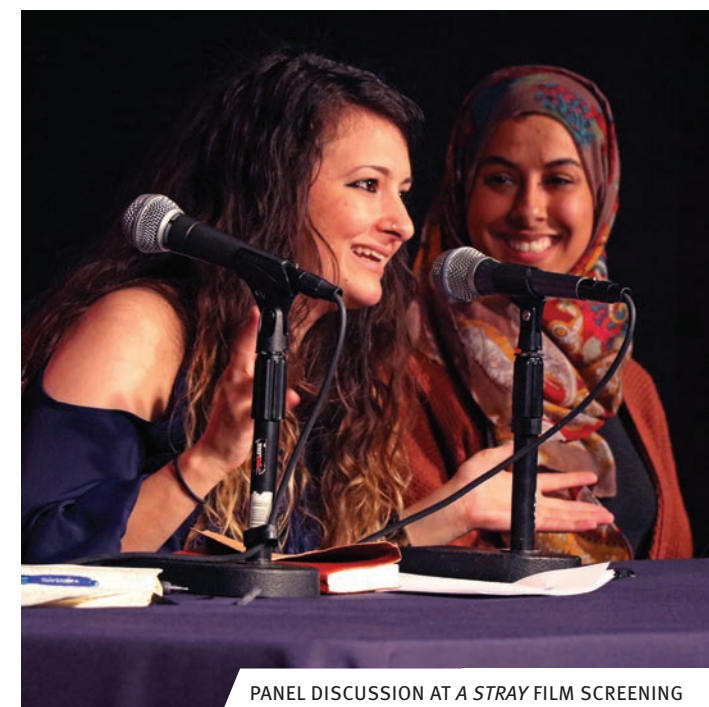
PANEL DISCUSSION AT A STRAY FILM SCREENING