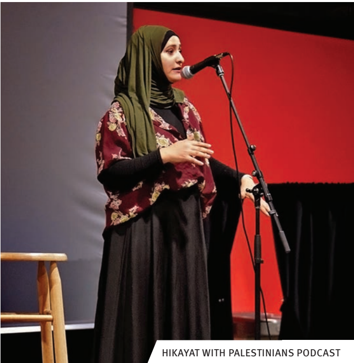
HIKAYAT WITH PALESTINIANS PODCAST