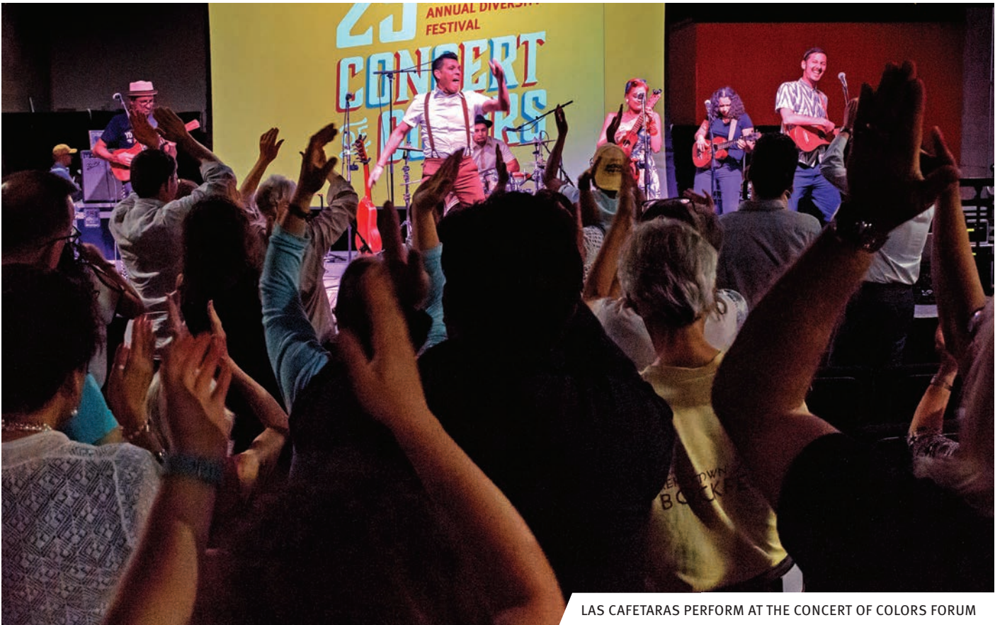
LAS CAFETERAS PERFORM AT THE CONCERT OF COLORS FORUM