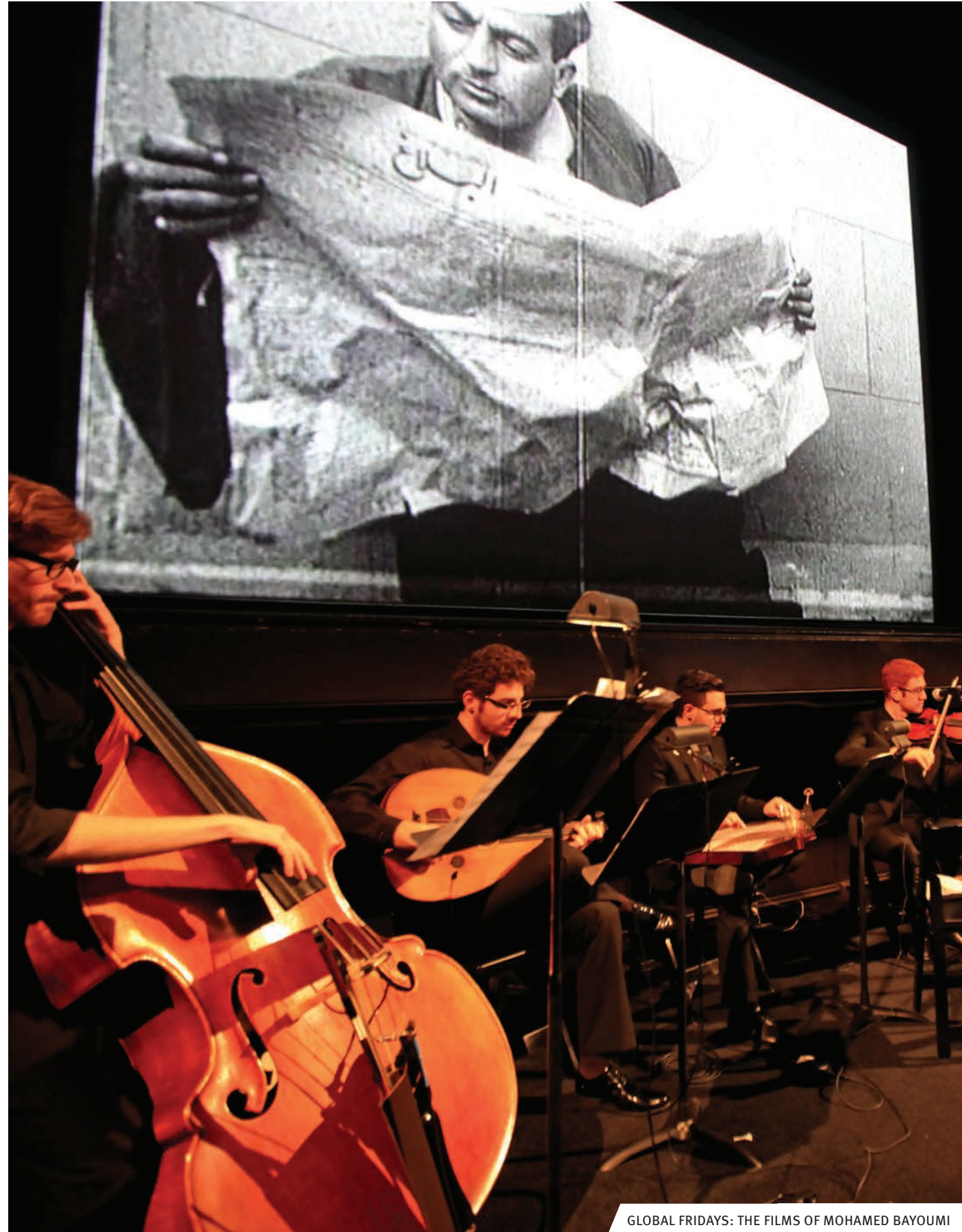
GLOBAL FRIDAYS: THE FILMS OF MOHAMED BAYOUMI