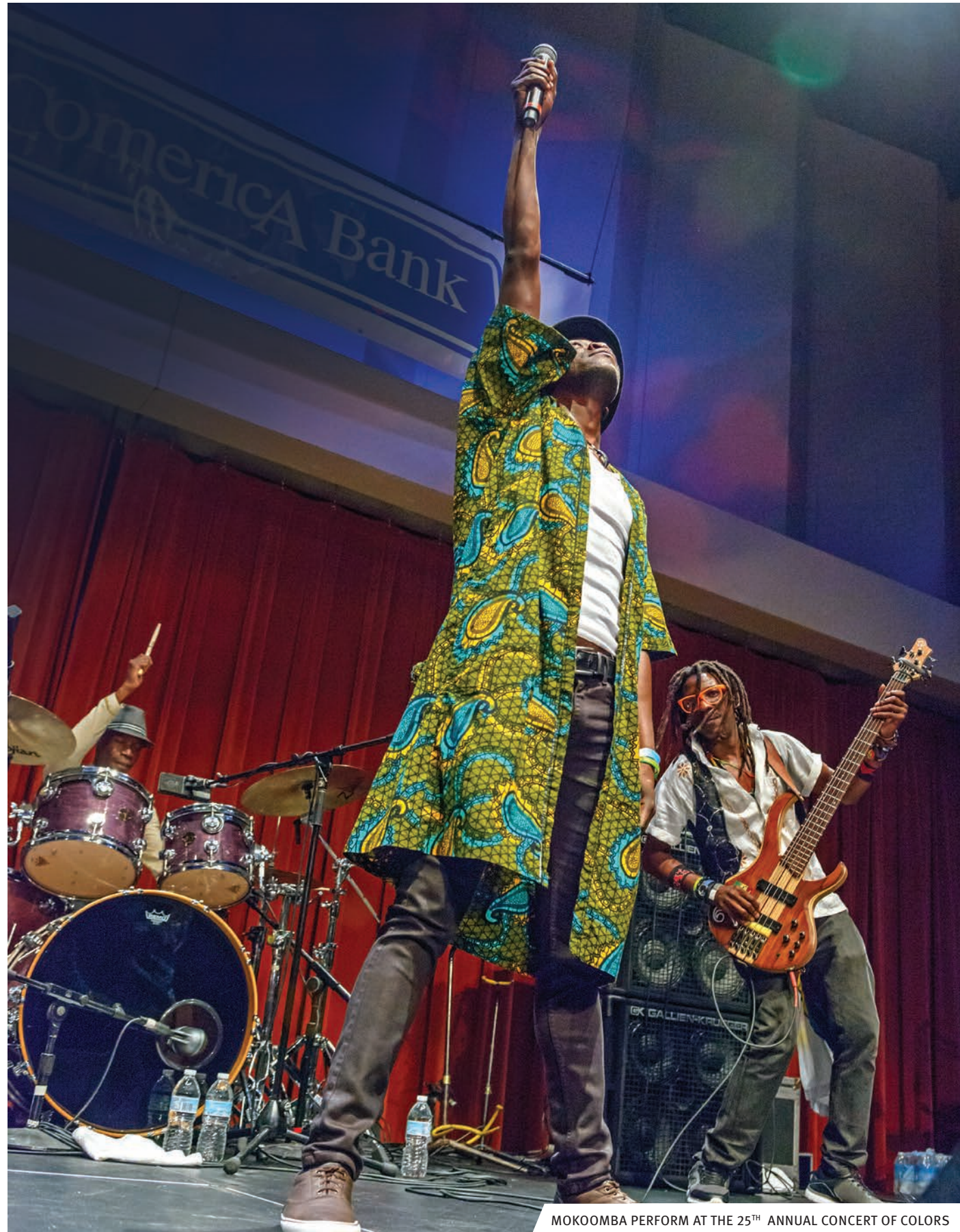
MOKOOMBA PERFORM AT THE 25 TH ANNUAL CONCERT OF COLORS