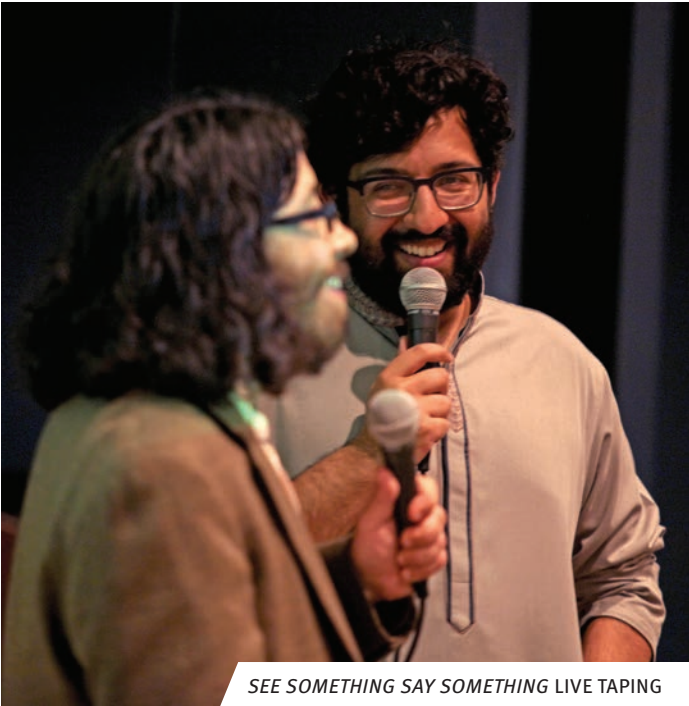
SEE SOMETHING SAY SOMETHING LIVE TAPING

Arab American storytellers shared personal tales centered on emotionally charged topics including identity, culture and politics during the launch of AANM’s Hikayat series. Presented in partnership with Palestinians Podcast, these emotional personal narratives gave audiences a sense of how today’s pressing issues are affecting individuals on a daily basis, promoting greater understanding. Free storytelling workshops provided tools and encouragement to community members seeking to share their own experiences with others.