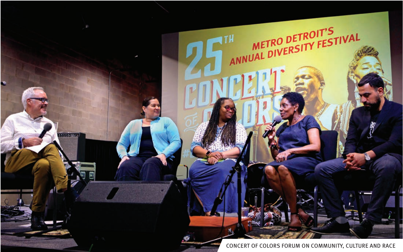
CONCERT OF COLORS FORUM ON COMMUNITY, CULTURE AND RACE