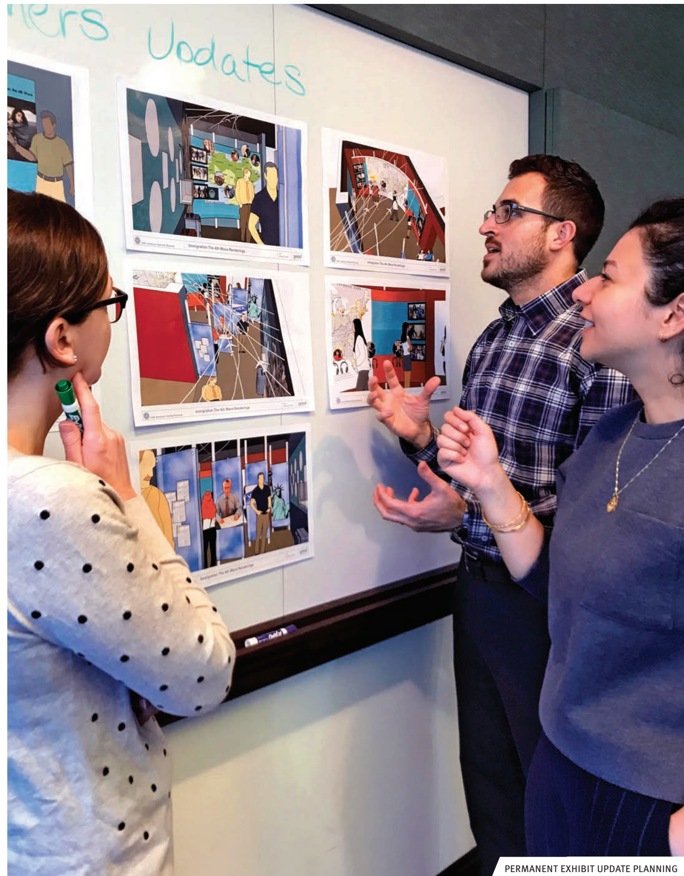
PERMANENT EXHIBIT UPDATE PLANNING