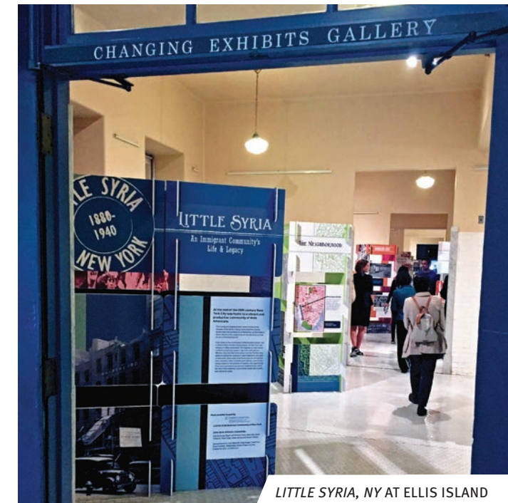
LITTLE SYRIA, NY AT ELLIS ISLAND

Because of AANM's sterling reputation as a forward-thinking, community-based institution, Museum staff were invited to share their knowledge and experience at major conferences including the Smithsonian Affiliations national conference; REMAP: Detroit presented by Arts in a Changing America; the National Association of Latino Arts + Culture's Michigan conference; DeVos Institute of Arts Management; National Council for Public History; and CityLab 4, presented by the Aspen Institute, Bloomberg Philanthropies and The Atlantic magazine.