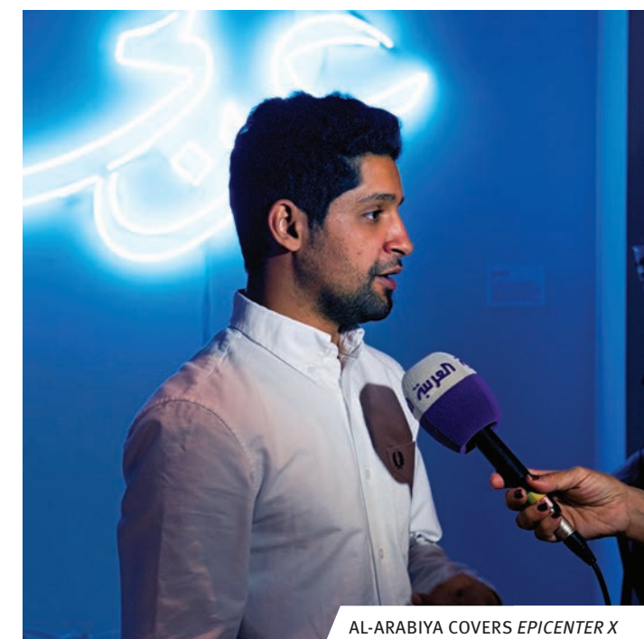
AL-ARABIYA COVERS EPICENTER X