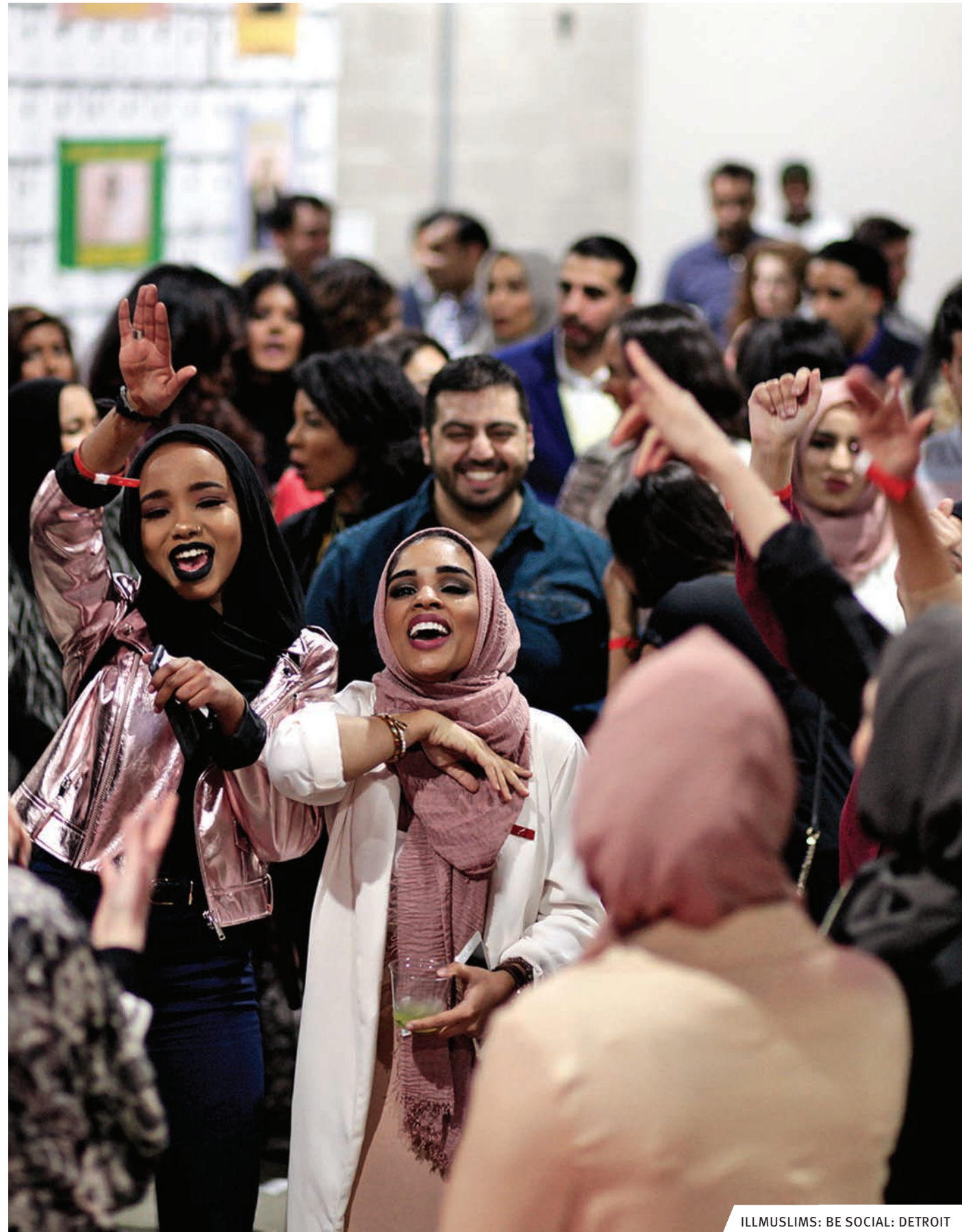
ILLMUSLIMS: BE SOCIAL: DETROIT